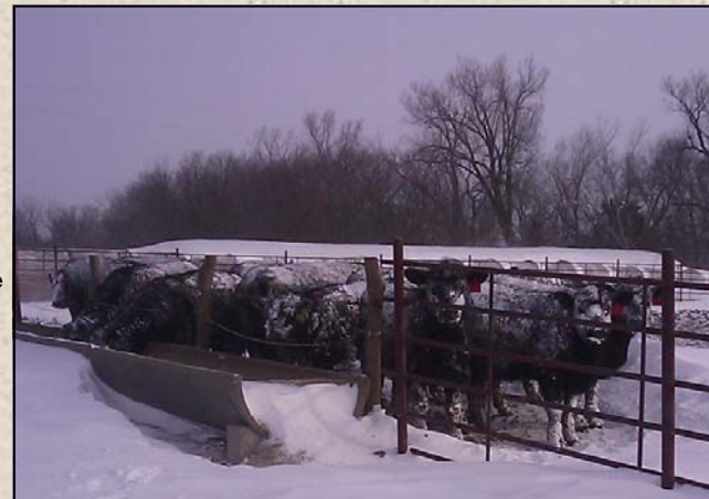
Do you remember the winters of '09-'10 & '10-'11?!

Example: You purchase a pen of 3 heifers and elect to have us calve them out. You pay gavel price plus $825 on sale day. Pairs will be available after